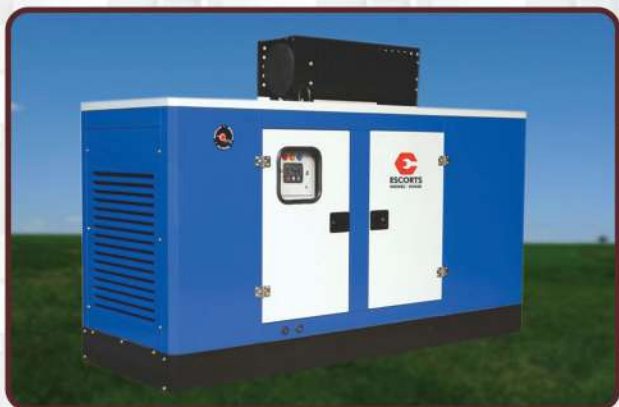
POWER BACK UP