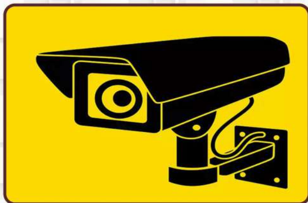
CCTV / SECURITY